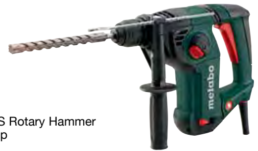
KHE3250 1 1/8" SDS Rotary Hammer w/Rotostop