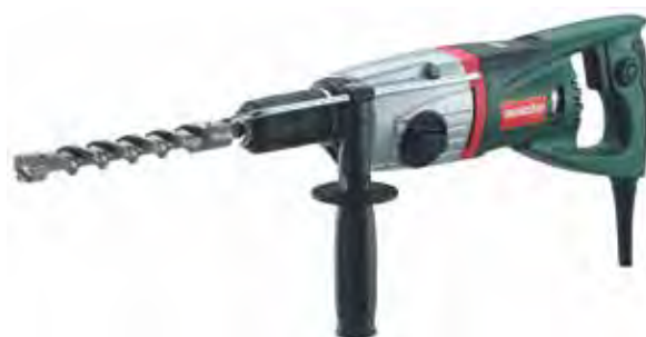
KHE-D28 1 1/8" SDS Rotary Hammer w/Rotostop