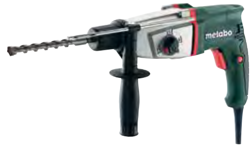
KHE2443 1" SDS Rotary Hammer with Rotostop