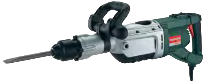
MHE96 SDS-Max Demolition Hammer