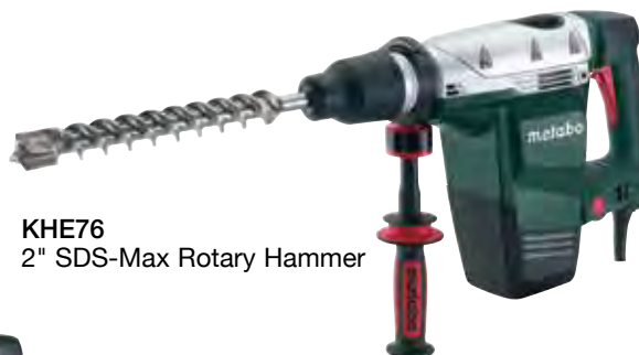
KHE76 2" SDS-Max Rotary Hammer