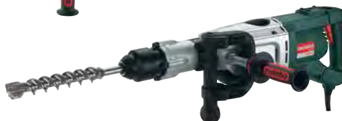
KHE96 2" SDS-Max Rotary Hammer