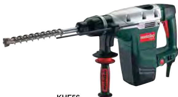
KHE56 1 3/4" SDS-Max Rotary Hammer