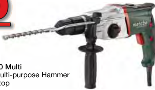
UHE2850 Multi 1 1/8" Multi-purpose Hammer w/Rotostop