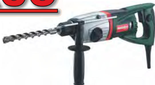
KHE-D24 1" SDS Rotary Hammer w/Rotostop