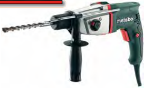
BHE2243 7/8" SDS Rotary Hammer