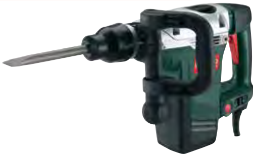
MHE56 SDS-Max Demolition Hammer